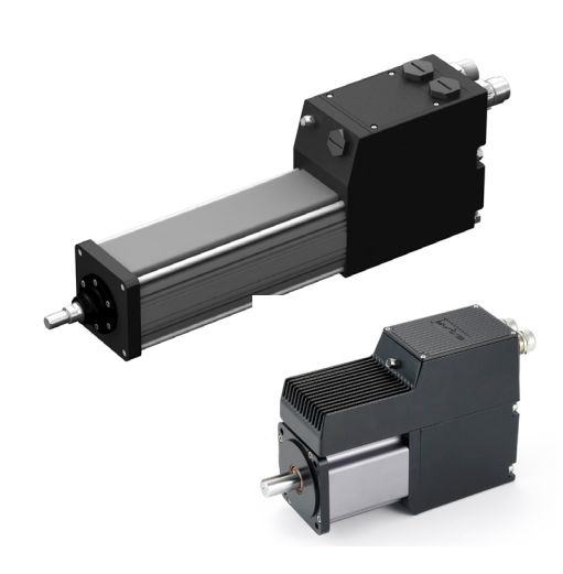
Tritex II Series Actuators combining servo motor, linear actuator, position controller and servo drive. Linear model shown top and rotary shown right.

The Tritex Actuator series consists of both linear and rotary servoelectric actuators, offering a unique combination of high speed, performance and accuracy, in a compact, lightweight package. The Tritex Actuator has speeds up to 25" per second, excellent position accuracy, and 100% continuous duty cycle. High performance is achieved with respect to speed, linearity, load sensitivity, deadband and temperature range.